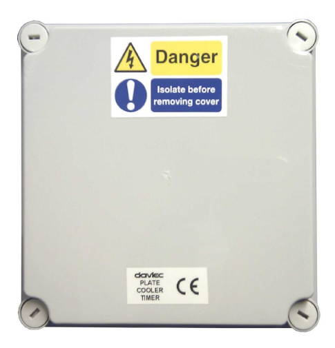
PLATE COOLER DELAY CONTROL